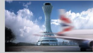
Control Tower Edinburgh Airport