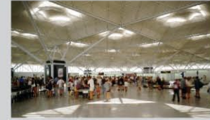
Passenger Terminal Stansted Airport