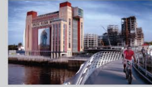
Baltic Centre Gateshead

Commercial applications carried out by Sarnafil Registered Contractors.