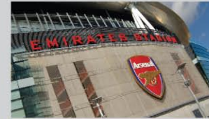
Emirates Stadium London