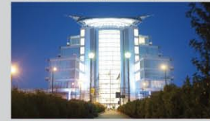
St David's Hotel Cardiff Bay